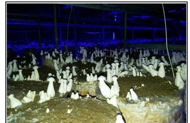
Figure 23 : Milky Mushroom Growing