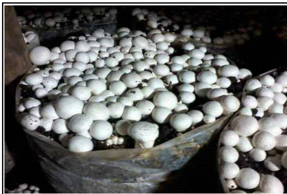
Figure 22 : Button Mushroom Growing