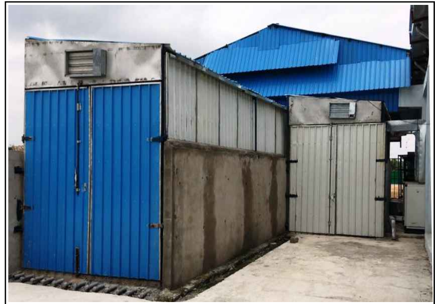
Figure 14 : Compost Tunnel