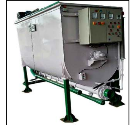
Figure 3 : Straw Pasteurization Machine