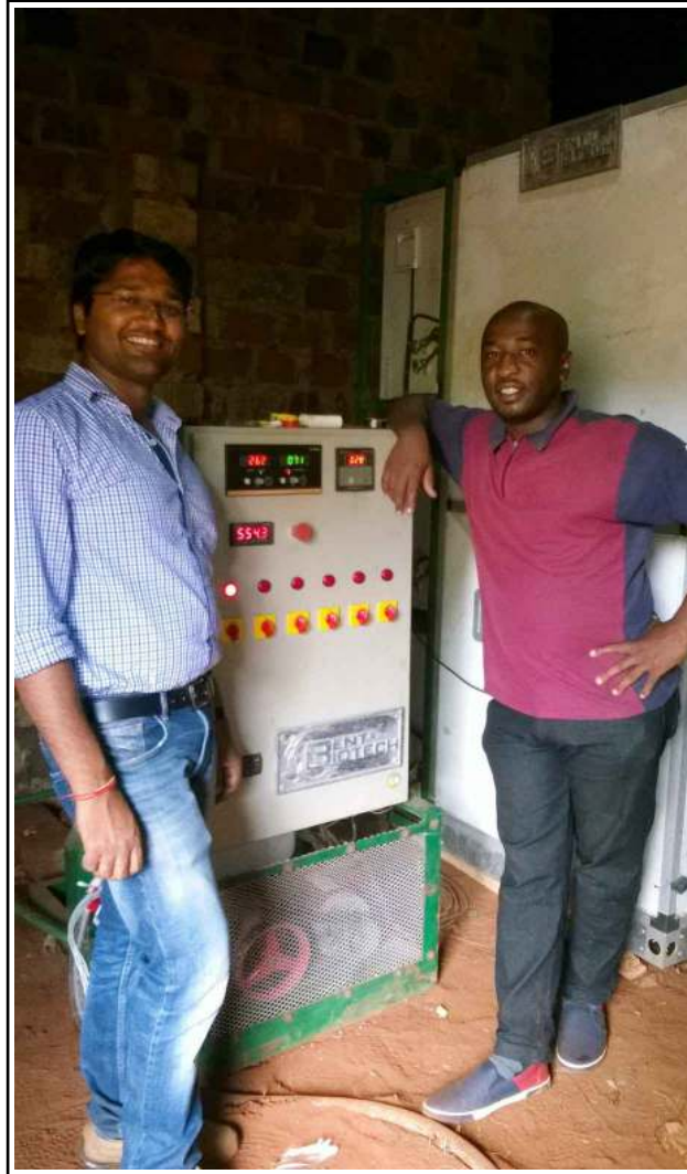
Figure 21 : Water Spraying & Air Handling Unit in Kenya