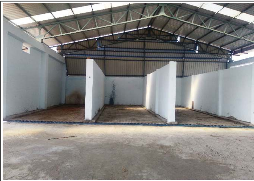
Figure 13 : Bunker Rooms