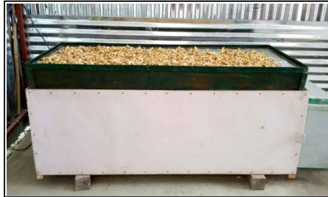
Figure 11 : Mushroom Dryer