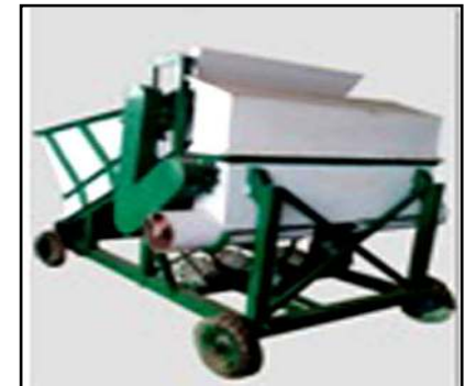
Figure 6 (ii) : Spawn Dozing & Bag Filling Machine for Button Mushroom