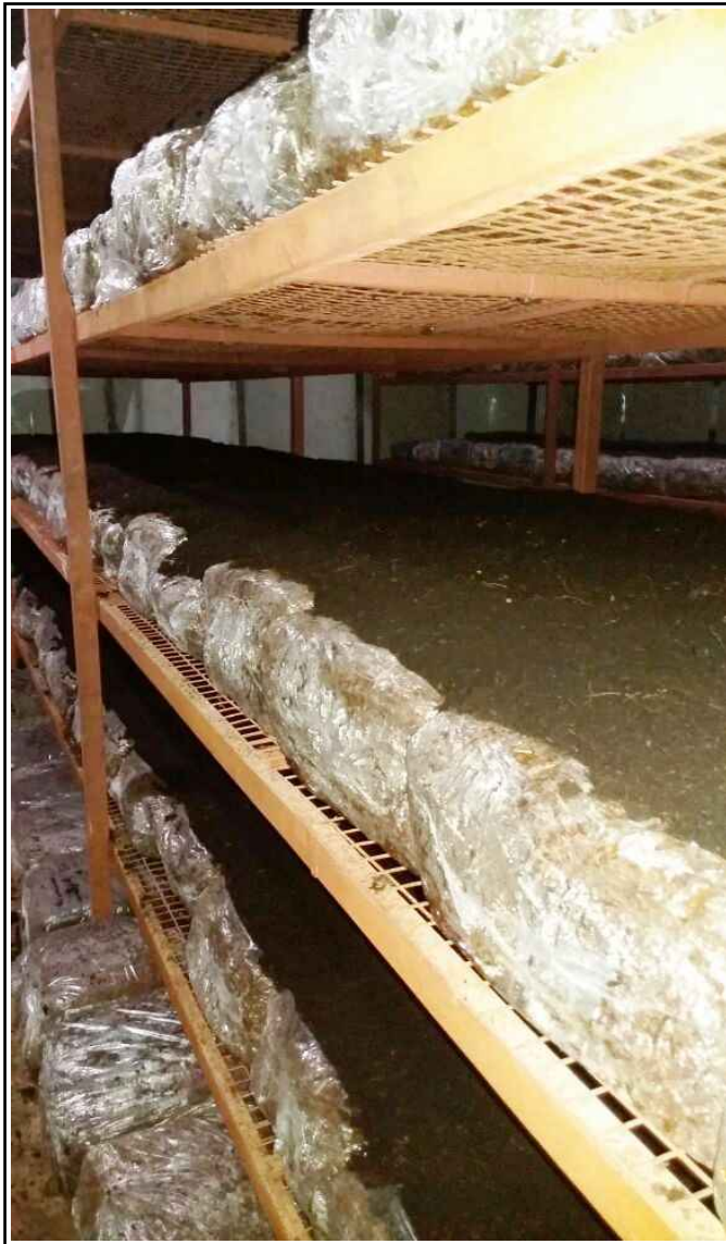
Figure 17 : Mushroom Growing Racks