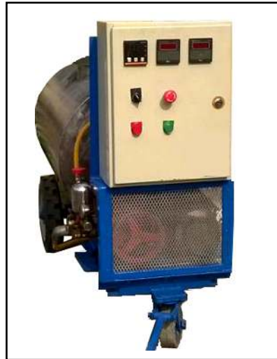
Figure 7 (ii) : Water Spraying System