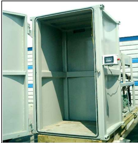
Figure 12 : Vacuum Refrigerator