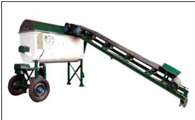
Figure 2 : Biocompost Mixing & Bag Filling Machine