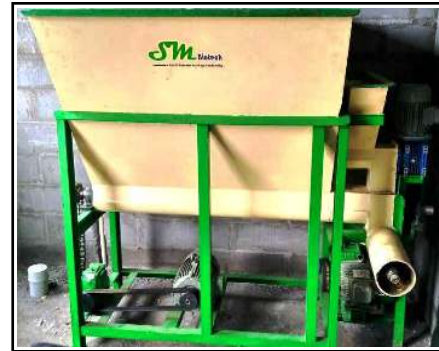
Figure 6 (i) : Spawn Dozing & Bag filling for Oyster & Milky Mushroom