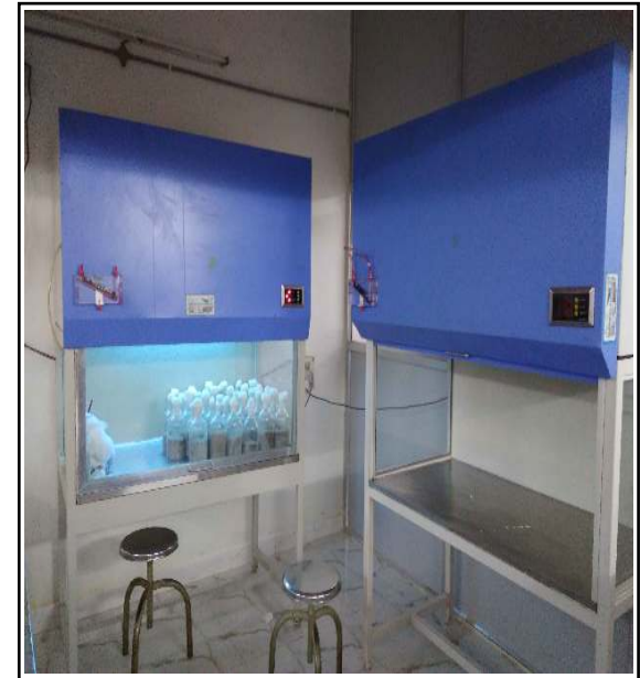
Figure 17 : Laminar Airflow