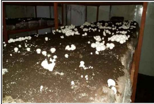
Figure 20 : Button Mushroom Growing