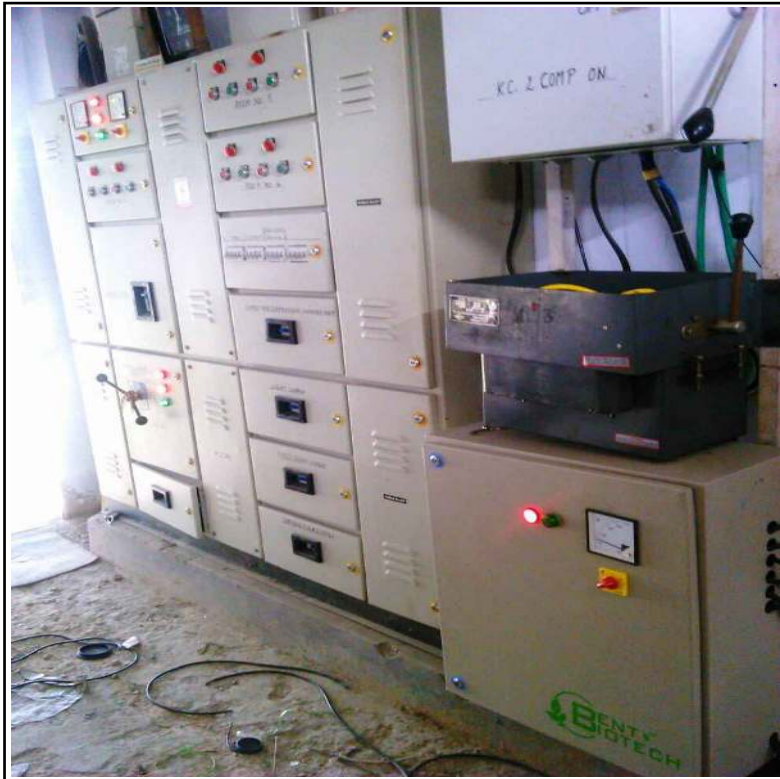
Figure 20 : Ammonia Compressor Automation

We do automation of the old constructed mushroom farm. During our automation service we upgrade the previously constructed mushroom plant with our latest technology based machinery & services. In up-gradation process as per the plant requirement we customize their old machines with latest technology or install new machinery to increase the production as well as quality of mushrooms.