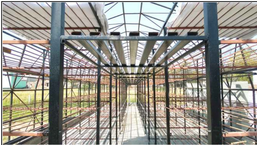
Figure 10 : Compost Holding Rack