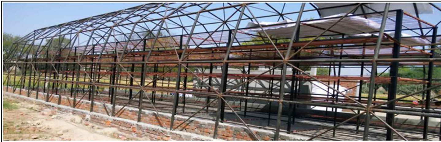
Figure 18 : Low Investment Dome Shape Shed

Our sheds are cost effective, highly durable and robust in nature, inside of shed you can do any type of application.