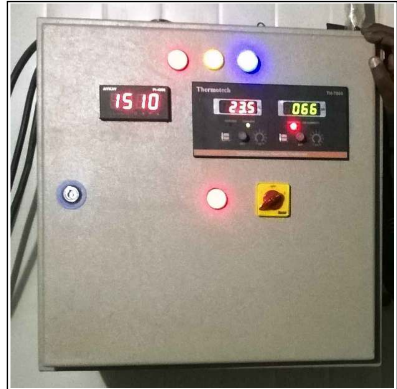
Figure 21 : Direct Expansion Cooling System Automation