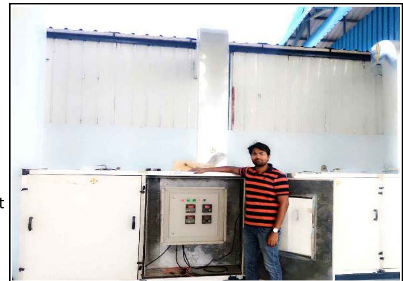
Figure 5 : Composting AHU