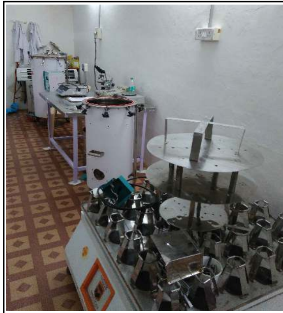
Figure 16 : Autoclave & Shakers