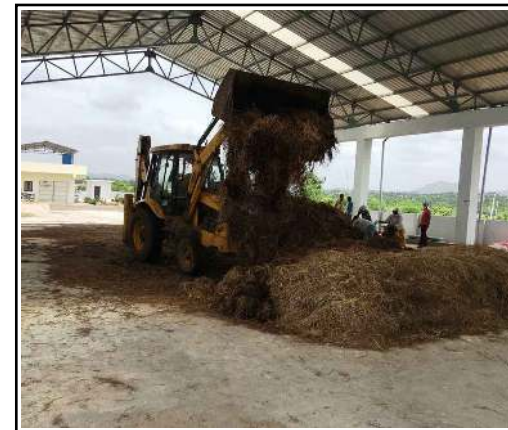
Figure 18 : Compost Turning Area