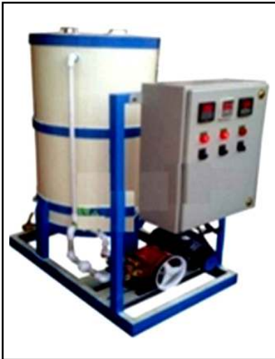
Figure 7 (i) : Water Spraying System