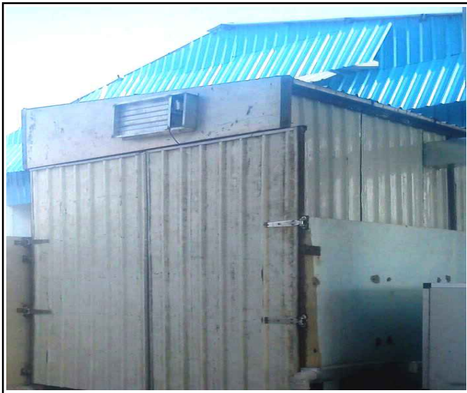
Figure 4 : Compost Tunnel