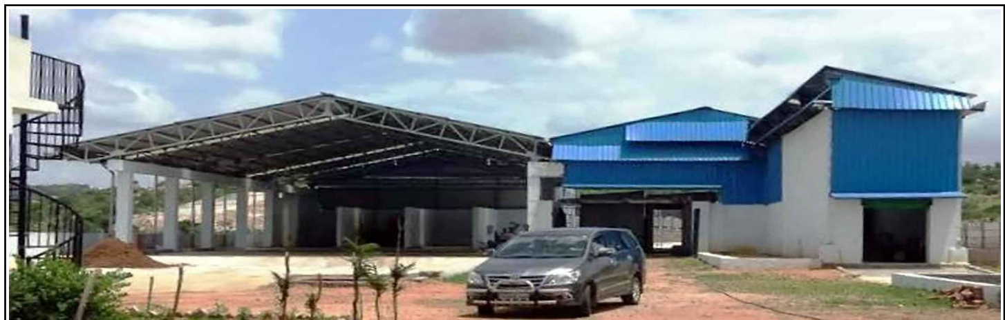
Figure 19 : Parallel Chord & Single slope Shed