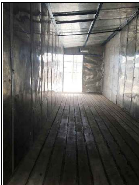
Figure 16 : Compost Tunnel with SS panels