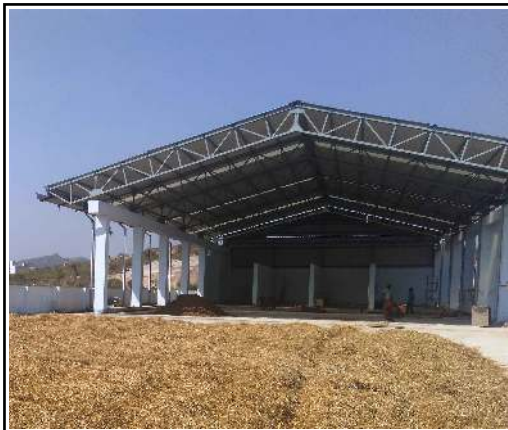
Figure 15 : Pre-wetting Area