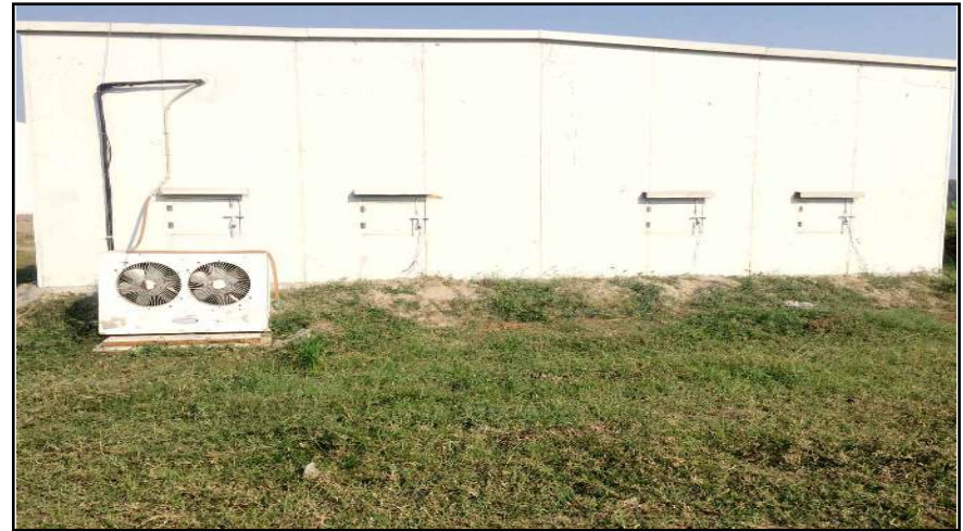
Figure 9 : Insulated Puff Panel Mushroom Growing Room