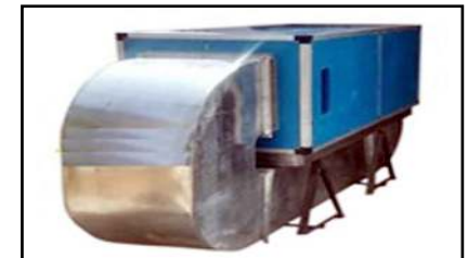
Figure 7 : Environmental Control System