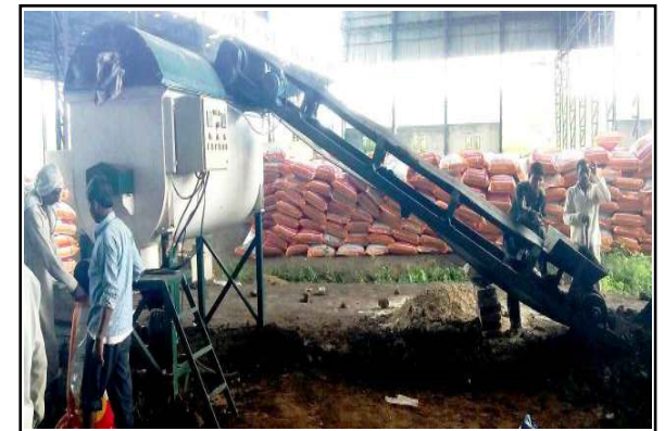
Figure 24: Biocompost Mixing & Bag Filling Machine