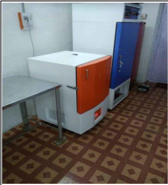
Figure 15 : Incubators

We assist you to install your own spawn lab to produce best quality of spawn. In Spawn lab formulation we provide all laboratory equipment and machinery such as laminar air flow, Autoclave, Incubators etc. We also trained you with the laboratory method used by scientist to produce mushroom spawn.